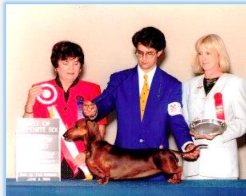
MBIS, MBISS CH Laddland Juliet ROMO