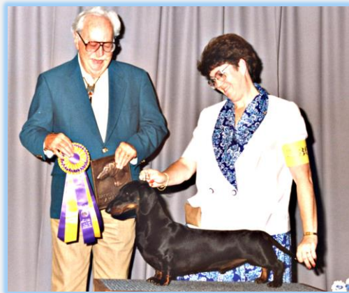
BIS, MBISS CH Laddland Wing And A Prayer ROMO